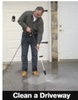
Clean a Driveway

The G 3050 OH is equipped with a reliable, easy to start 187cc HP Honda GC 190 engine and a full set of our patented Pro-Style nozzles. A full line of accessories is available to further enhance the capabilities of this exciting new pressure washer. Elevate your level of cleaning today with the G 3050 OH from Kärcher!