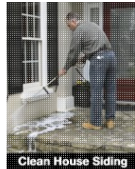
Clean House Siding