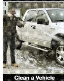
Clean a Vehicle